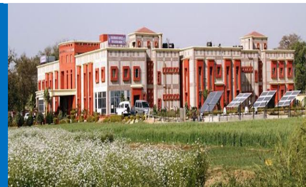
Administrative building cum Laboratory, ICAR- RCER, Patna

Free boarding and lodging, as per Ministry of Agriculture approved norms will be arranged in the Institute Guest house for all participants. The selected participants will be paid for the journey, to and fro, restricted to AC-II tier fare or bus as the case may be as per approved norms (for state officials only). Trainees from ICAR, SAU's, KVKs etc. have to claim their TA from their respective organization. Patna, which is well connected by air, rail and road to major cities of India, The Patna railway station is approximately 10 km and bus stand is about 14 km from the Institute. Important landmark for reaching the Institute is Patna Airport and Bihar Veterinary College which are located within 1 Km distance from the Institute.